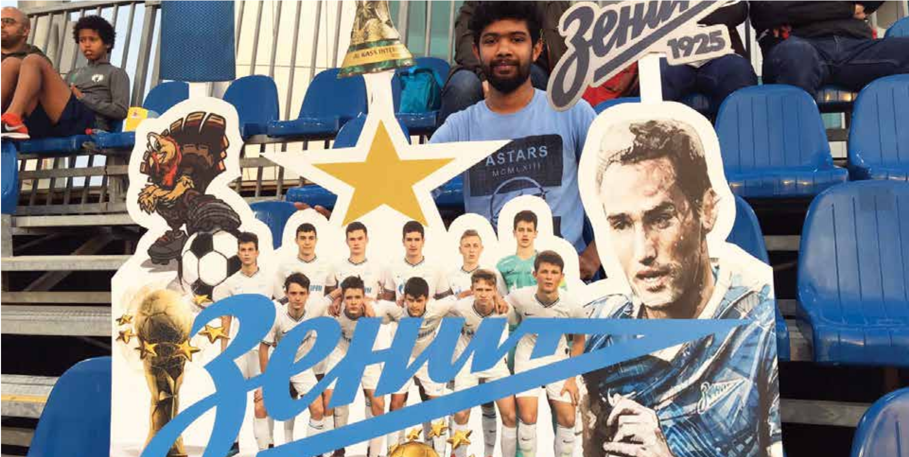
Al Kass International Cup