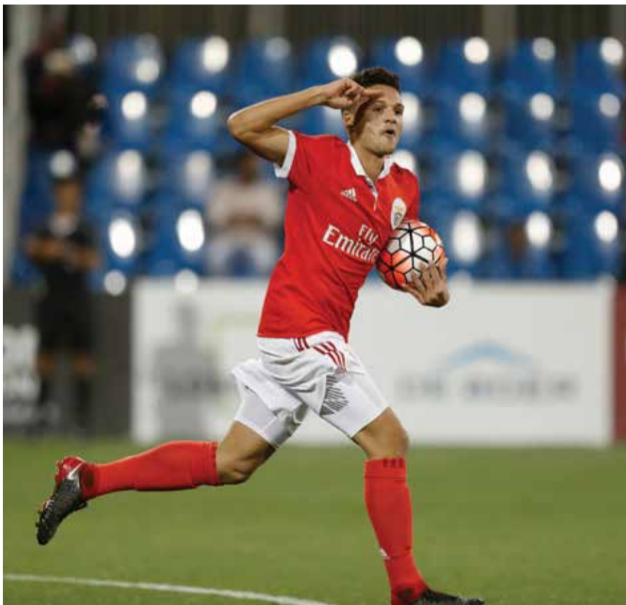
GONÇALO RAMOS BENFICA