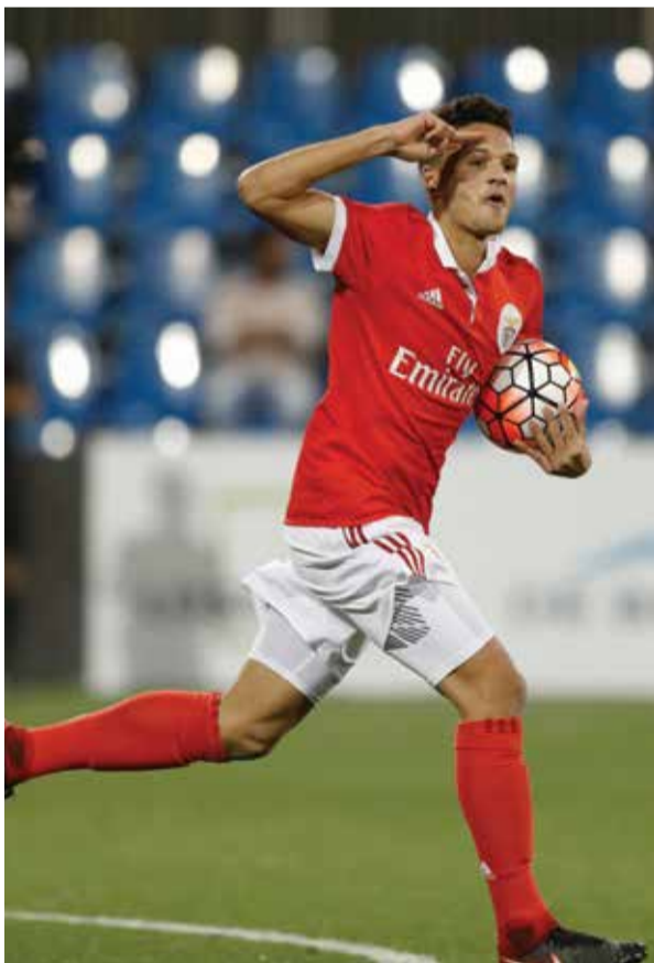
GONÇALO RAMOS BENFICA