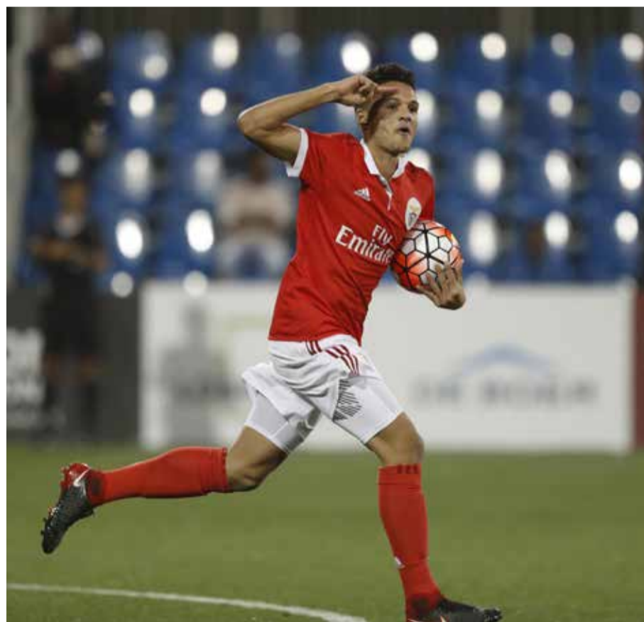
GONÇALO RAMOS BENFICA